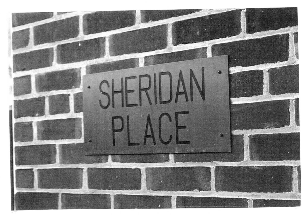
Plaque on exterior wall of former Sheridan Place adjacent to main entrance.