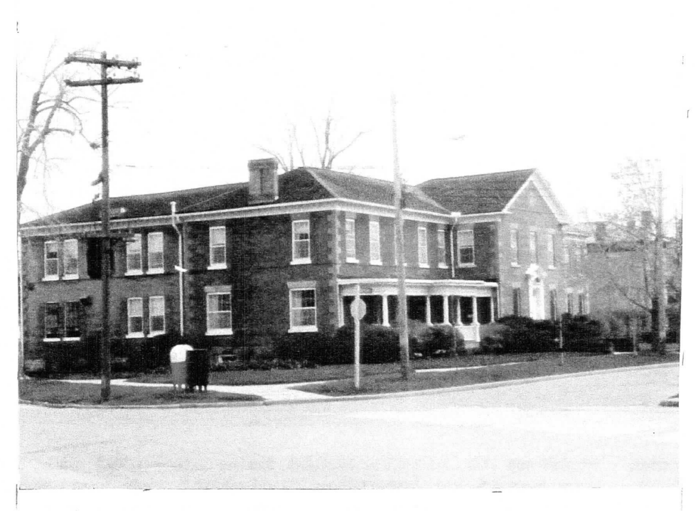
Sheridan Place as it would have appeared in the 1980's