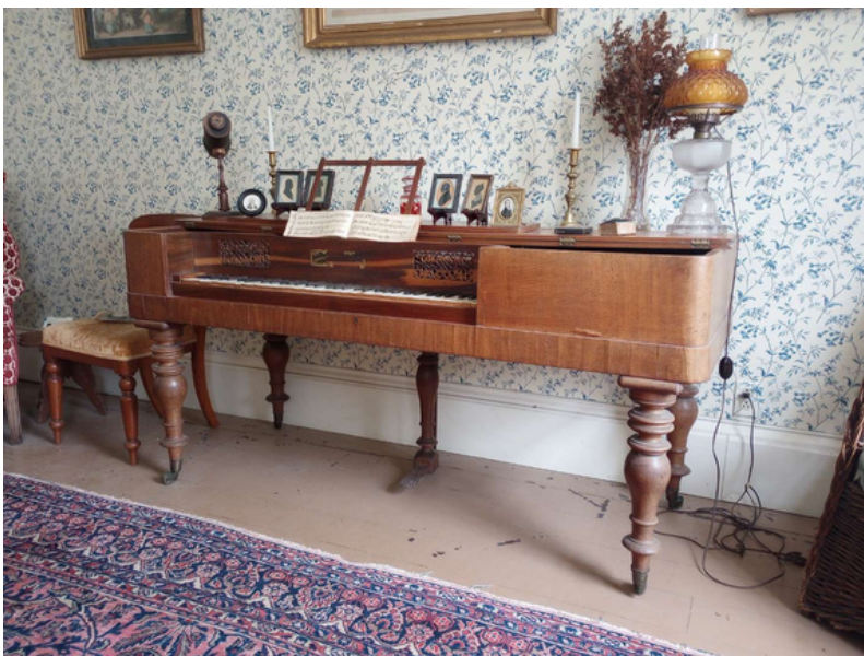
The piano forte, as it stands in the parlour at Myrtleville House Museum today.

The family still enjoyed their wealthy comforts, as shown in the piano forte that Allen's brother John had ordered from London, England for them. It arrived at Myrtleville in 1840 wrapped in blankets, which the family kept for generations, and cost a total of 46 pounds ($10,100 today). It is said to be the oldest piano in the city, if not southern Ontario, west of Hamilton. The instrument still sits in the parlour, a testament to the family that loved music, art, adventure, and the house they called home for four generations. Happy Anniversary, Myrtleville.