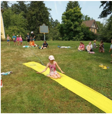
Campers having fun with the 'Slip-and-Slide' at Myrtleville House Museum

The Brant Historical Society hosted a number of new fundraisers, special events, and exhibit openings in 2025. Thirty-two people attended our 3rd Annual Scotch Tasting fundraiser, hosted once again at the Canadian Military Heritage Museum. The evening included a program of 5 scotch samples, haggis tasting, and highland dance demonstrations by students of the Angus Academy of Highland Dance.